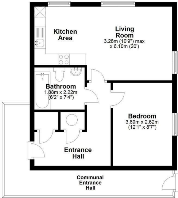
Total area: approx. 43.1 sq. metres (464.2 sq. feet) Flat 10, Brian Roberts House, Beach Street, Herne Bay